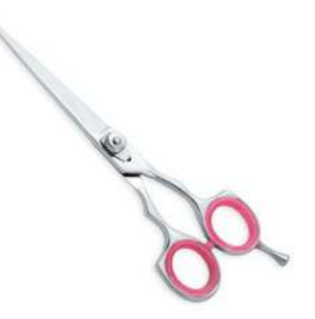
Platinum Touch Professional Barber Scissors

Available in Stainless steel AISI 420 or 440 with hollow ground inner blades and Convex edge, One of our best selling model available in many sizes and its equally popular in hair stylists and for people who work for pet grooming. 5, 6.5", 7.5", 8.5", 9.5"