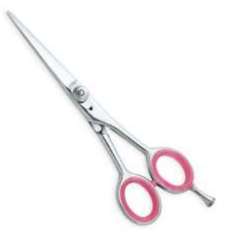
Fine Professional Barber Scissors DSI-1011013

Available in Stainless steel AISI 420 or 440 with hollow ground inner blades and Convex edge, Conventional model for the stylist who likes to keep it simple.