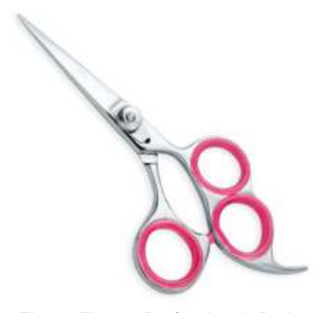
Three Finger Professional Barber Scissors