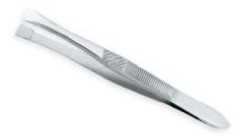
Eyebrow Tweezers DSI-1121012 Eyebrow Tweezers 3.5", 4"