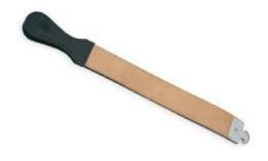
Leather Strop DSI-1061023 Leather Strop. Cowhide Leather