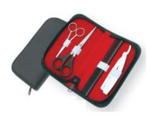
Men Grooming Kit DSI-1161018 Men Grooming Kit Contains: Noose Scissors #846 Standard barber Scissors # 090 Plastic Comb