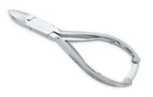
Nail Nipper DSI-1141004

Forged from Surgical Grade Stainless Steel with Box Joint, double Sheet Springs for smooth operation and ideal for professional pedicure work. 5.5"