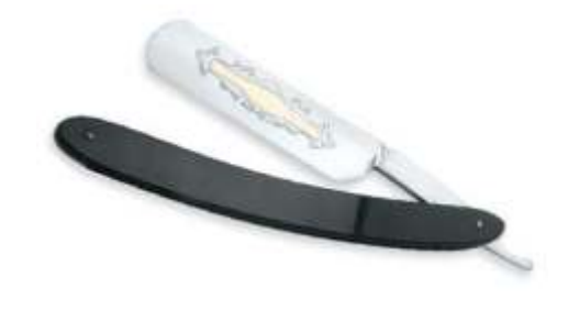
Fix Blade Razor DSI-1061028 Fixed Blade Razor with wide blade.& Special etching on blade. Available in white & Black Colors Color: Black & White