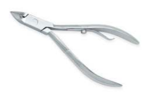
Cuticle Nippers DSI-1141006

Forged from Surgical Grade Stainless Steel with Lap Joint, Single Sheet Spring and finished to perfection. 3.5", 4", 4.5"