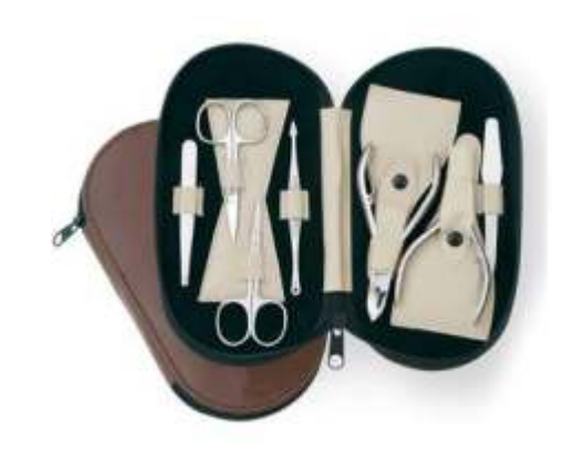
Manicure & Pedicure Kit 7 DSI-1161005 Manicure & pedicure set packed in fine leather and velvet pouch