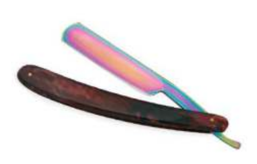
Fixed Blade Razor DSI-1061025 Fixed Blade Razor With Multi Color Titanium Coating Various Colors available