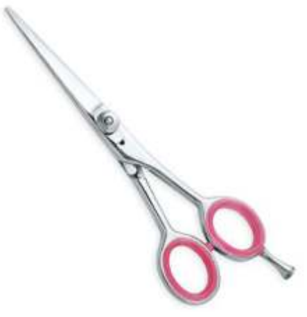
JN Professional Barber Scissors DSI-1011014

Available in Stainless steel AISI 420 or 440 with hollow ground inner blades and Convex edge, Another model with samurai type blades for a creative cut. 6 1/2"