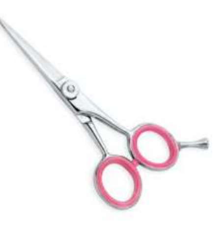
Light Weight Professional Barber Scissors

Available in Stainless steel AISI 420 or 440 with hollow ground inner blades and Convex edge, Another model with samurai type blades for a creative cut. 6 1/2"