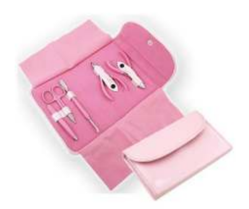
Manicure & Pedicure Kit 5 DSI-1161002 Manicure Set Contains: Nail Nipper # 914 Tweezers # 081 Cuticle Nippers # 911 Pushers # 146 Nail Scissors #856