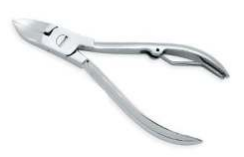
Nail Nipper DSI-1141002

Forged from Surgical Grade Stainless Steel with Box Joint, Single Sheet Spring and finished to perfection 3.5", 4"