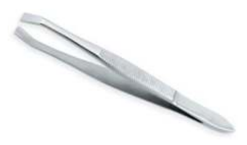
Eye Brow Tweezers DSI-1121005 with taxture on handles for grip 3.5", 3.5", 4"