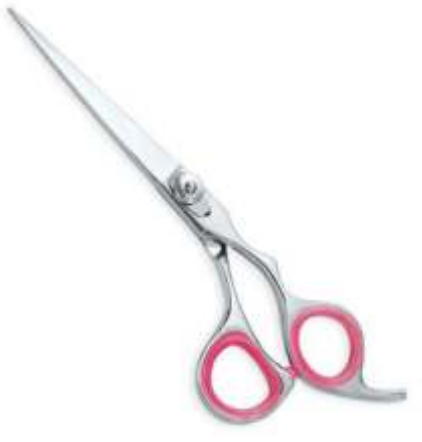
Mod Style Professional Barber Scissors