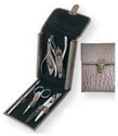
Manicure Set DSI-116 1016 Manicure Set Contains: Nail Nippers # 914 Cuticle Nippers #911 Tweezers # 081