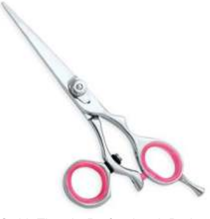
Swirl Thumb Professional Barber Scissors

Available in Stainless steel AISI 420 or 440 with hollow ground inner blades and Convex edge, Its modern design for people like to try different models.