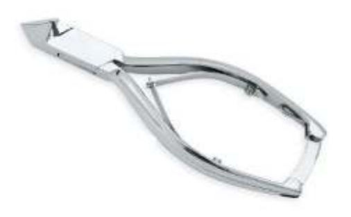
Nail Nippers DSI-1141014

Forged from Surgical Grade Stainless Steel with Special multi Joints, and smooth cutting operation for professional work.