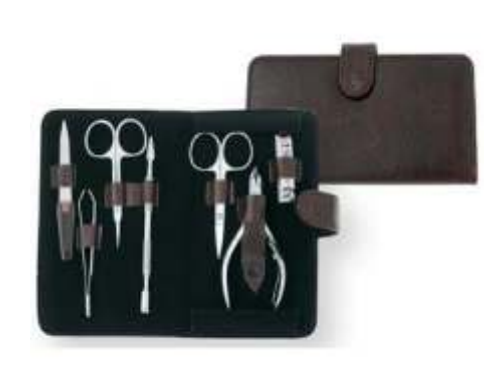
Manicure Set DSI-1161013 Manicure Set Contains: Nail Nippers Cuticle Nippers # 911 Nail Scissors # 858 Cuticle Pusher # 144