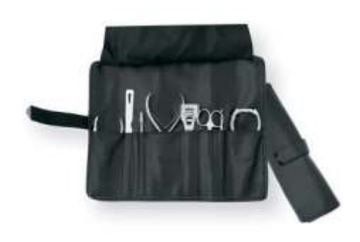
DSI-1161004 Professional Quality kit with fine quality manicure and pedicure instruments packed in combination of leather, available in different combinations of leather.