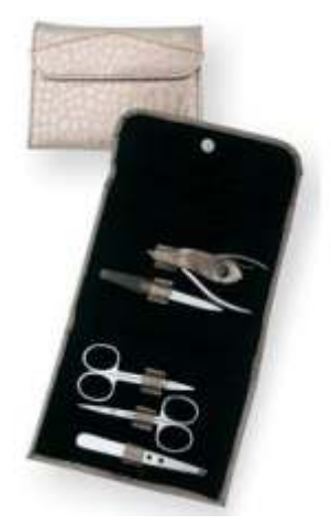
Professional Manicure Set DSI-1161017 Professional Manicure Set Contains: Nail Nippers Cuticle Nippers #911 Nail File # 105