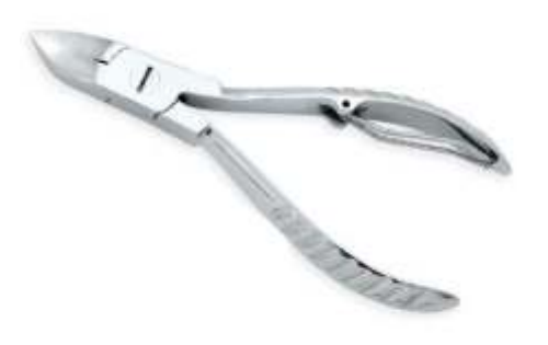
Nail Nippers DSI-1141026

Forged from Surgical Grade Stainless Steel with Lap Joint, Barrel Sheet Spring and finished to perfection 4.75 mm