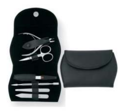
Professional Manicure Set DSI-1161015 Professional Manicure Set Contains: Cuticle Nippers # 979 Nail Scissors # 858 Nail File # 105