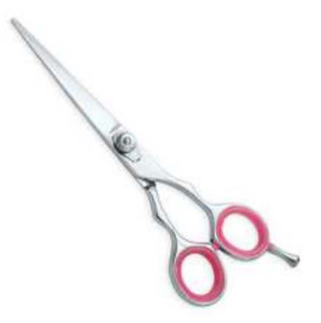
JP Professional Barber Scissors DSI-1011005

Available in Stainless steel AISI 420 or 440 with hollow ground inner blades and Convex edge, One of all time favorite available is four sizes, equally popular in hairstylists and pet grooming industry 5.5", 6.5", 8", 9"