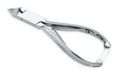
Nail Nippers 45°

Forged from Surgical Grade Stainless Steel with Box Joint, double Sheet Springs for smooth operation and ideal for professional pedicure work. 5.5"