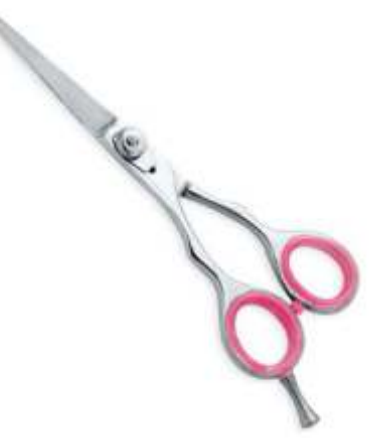
Left Handed Professional Barber Scissors

Available in Stainless steel AISI 420 or 440 with hollow ground inner blades and Convex edge, Little heavy than most of the models and ideal for people who want to work with little heavy Scissors. 6.5"