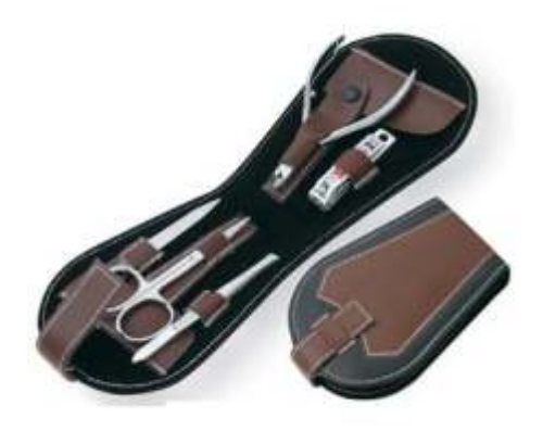
Manicure Set DSI-1161014 Manicure Set Contains: Nail Nippers Cuticle Nippers # 911 Nail Scissors #852