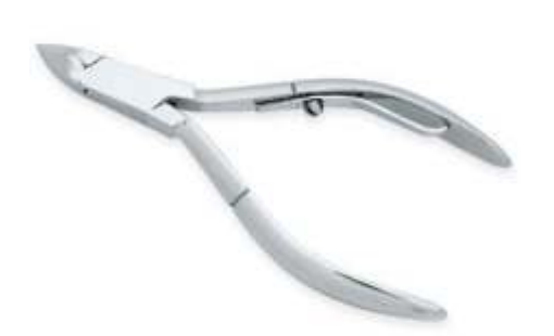
Cuticle Nippers DSI-1141005

Forged from Surgical Grade Stainless Steel with Lap Joint, Single Sheet Spring and finished to perfection. 3.5", 4", 4.5"