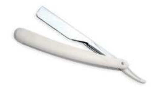
Razor Blade Holder DSI-1061027 Razor Blade Holder Various Colors available