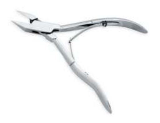
Nail Nippers DSI-1141032

Forged from Surgical Grade Stainless Steel with Box Joint, Double Sheet Spring and ergonomically designed for comfort operation