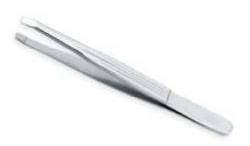
Eye Brow Tweezers DSI-1121009 Eye Brow Tweezers 3.5"