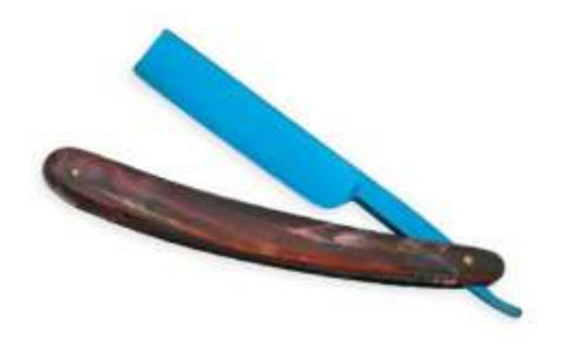
Fixed Blade Razor DSI-1061024 Fixed Blade Razor Blue titanium coating Various Colors available