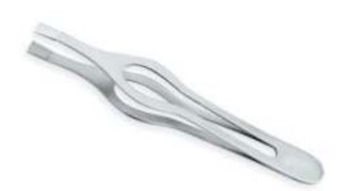
Eye Brow Tweezers DSI-1121008 Eye Brow Tweezers