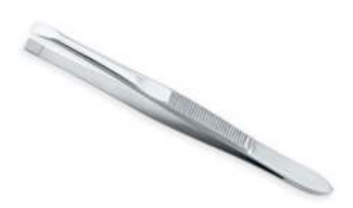
Eye Brow Tweezers DSI-1121003 with thumb grip on handles 3.5", 3.5", 4"