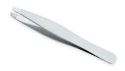
Eye Brow Tweezers DSI-1121010 Eye Brow Tweezers 3.5"