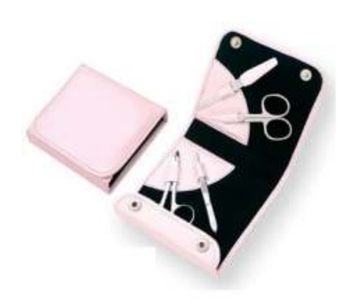
Manicure Kit 4 Pcs DSI-1161001 This is pocket manicure sets with leather pouch available in many colors.