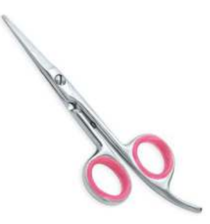
Delicate Cut Professional Barber Scissors