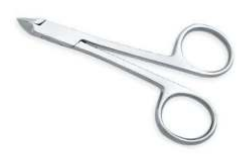
Cuticle Nippers Scissors Type DSI-114 1033

Forged from Surgical Grade Stainless Steel with Box Joint, Double Sheet Spring and ergonomically designed for comfort operation