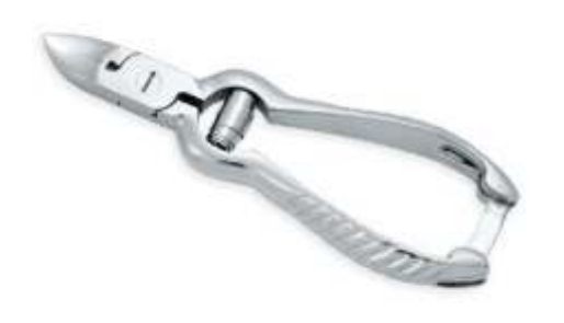
Nail Nipper DSI-1141 006

Forged from Surgical Grade Stainless Steel with Lap Joint, Single Wire Spring and finished to perfection. 4", 4.5", 4.75 mm