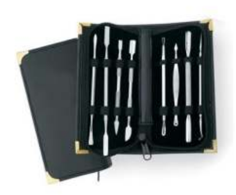
Nail Pushers DSI-1161009

Economy version of manicure set in velvet pouch.