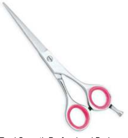
Real Smooth Professional Barber Scissors DSI-1011016 Professional Barber Scissors

Available in Stainless steel AISI 420 or 440 with hollow ground inner blades and Convex edge, Ultra light weight and small blades makes it choice of stylists who want a Scissors with small blades.