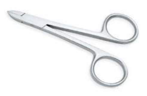
Cuticle Nippers Scissors Type DSI-1141034

Forged from Surgical Grade Stainless Steel with Box Joint, without spring