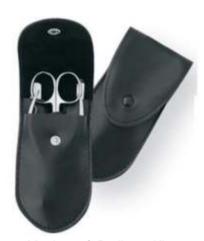
Manicure & Pedicure Kit 5 DSI-1161003 This is Economy version of pocket manicure set, Available in many colors.,