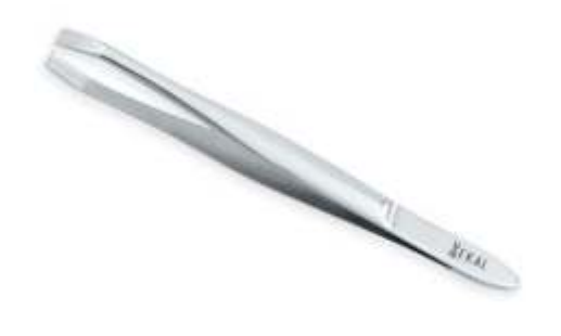
Plane Eye Brow Tweezers DSI-1121004 Plane Eye brow Tweezers 3.5", 3.5", 4"