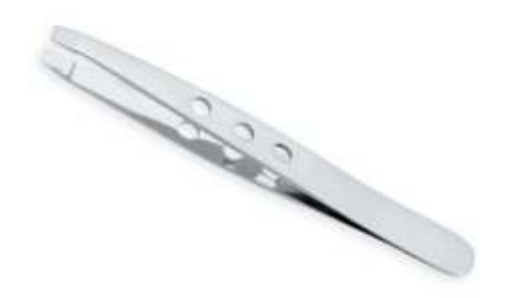
Flat Eye Brow DSI-1121001 Tweezers, Perforated 3.5", 3.5", 4"