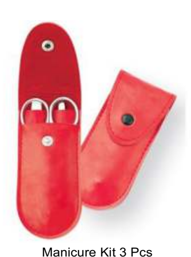
DSI-1161006 Manicure kit packet in velvet pouch available in many colors.