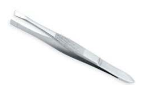
Eye Brow Tweezers DSI-1121002 With texture on handles for grip 3.5", 3.5", 4"