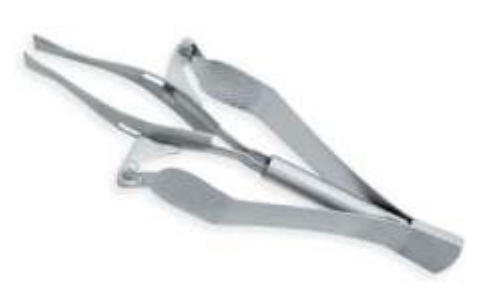
Automatic Tweezer DSI-1121006 Automatic Tweezer 4.5"