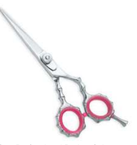
Star Professional Barber Scissors DSI-1011024

Available in Stainless steel AISI 420 or 440 with hollow ground inner blades and Convex edge, It's a very new model and is already a hit, Really a nice balanced pair of scissors.