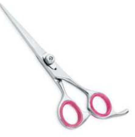
Super Smooth Professional Barber Scissors