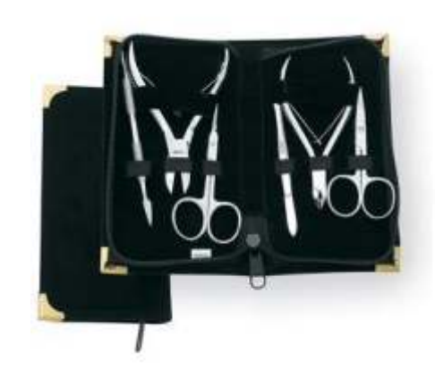
Manicure Kit 6 Pcs DSI-1161008

Essential for every manicure & Pedicure professional, packing available in different colors of velvet and leather pouches