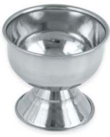
Barber Shaving Cup DSI-1061026 Barber Shaving Cup Material: Fully Stainless Steel